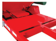
Platform For Safe, Easy Hopper Access