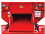
Large Unloading Door For Easy Access