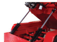
Dump System - Pivot Point & V-Body