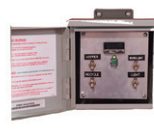
Patented VIP - Low Voltage Shutdown