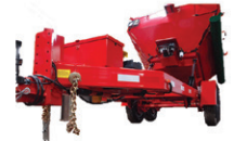
Lifetime Frame Warranty